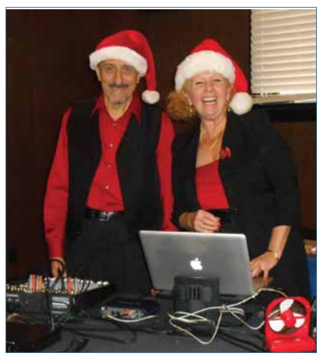
Party Time DJs were Rockin around the Christmas Tree and entertaining all the folks.