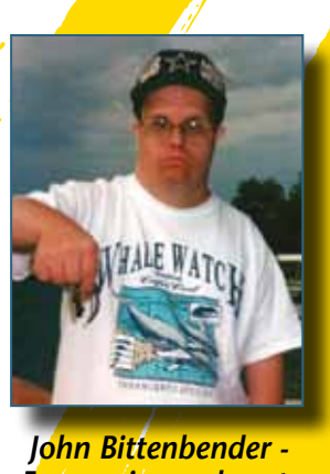
Forever in our hearts Tribute on page 3